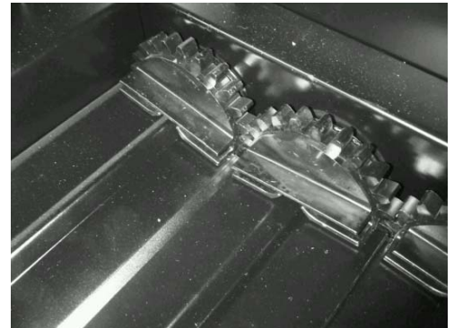
Heavy Duty Gear Driven Damper Control for high reliability