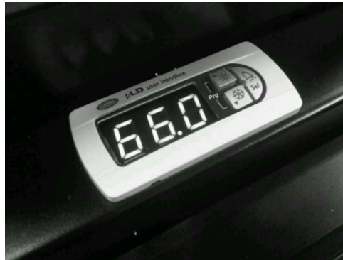
User set point control, display for peak temperature at rack